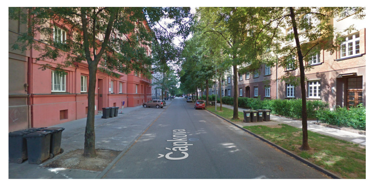
Figure 2: Privatized (on the left) and restituted (on the right) apartment buildings in Čápkova street, Brno.

privatize. Finally, privatizers were free to sell their apartments. However, their ability to do so was probably quite limited as Czech banks did not provide mortgages for coop-owned housing units, limiting the demand.